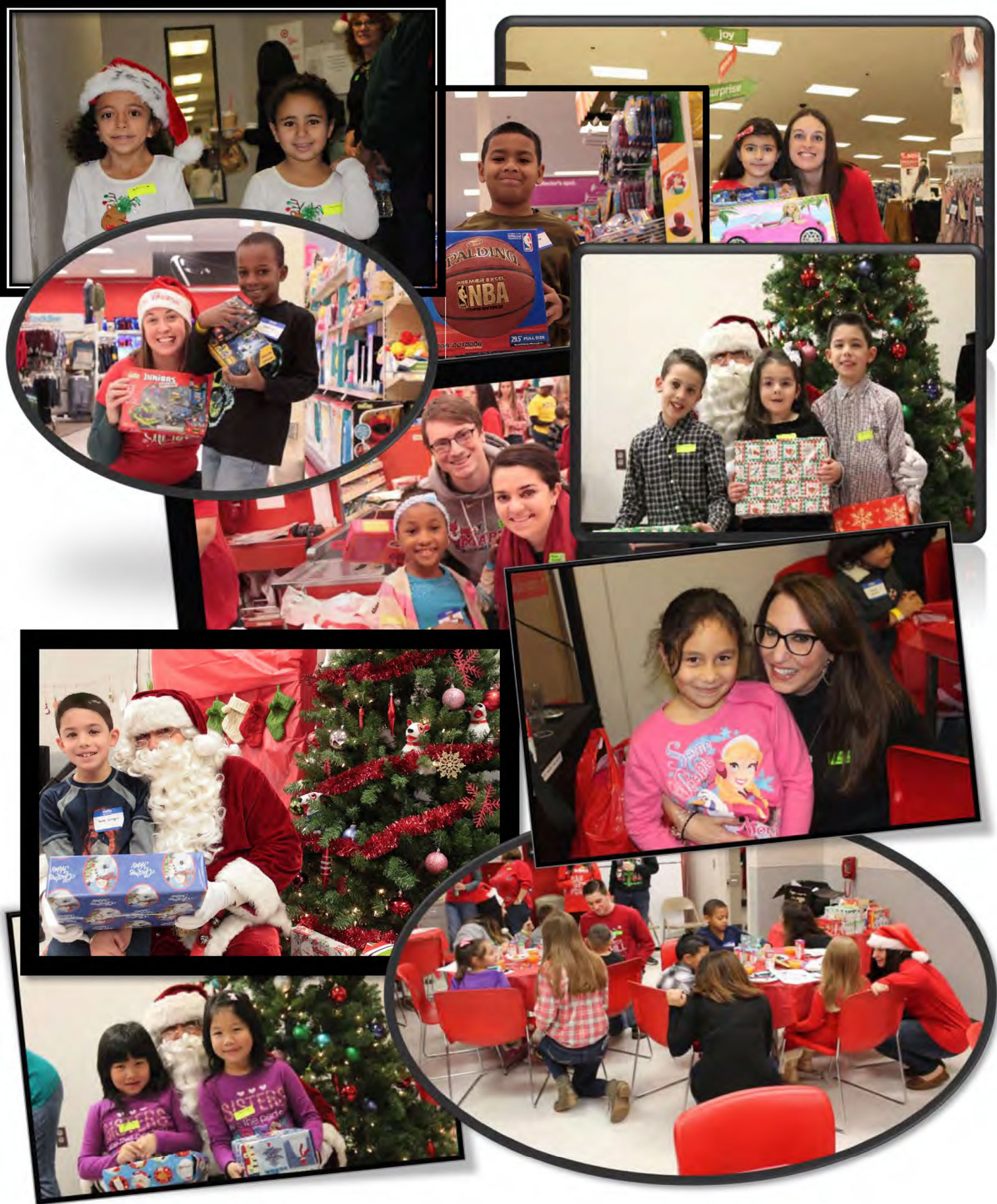
Making Smiles at Holiday Spree Events