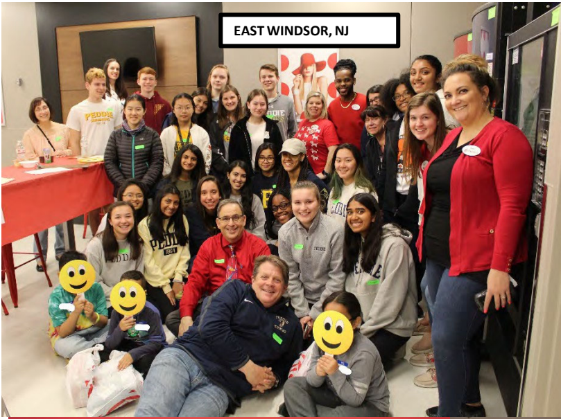
EAST WINDSOR, NJ