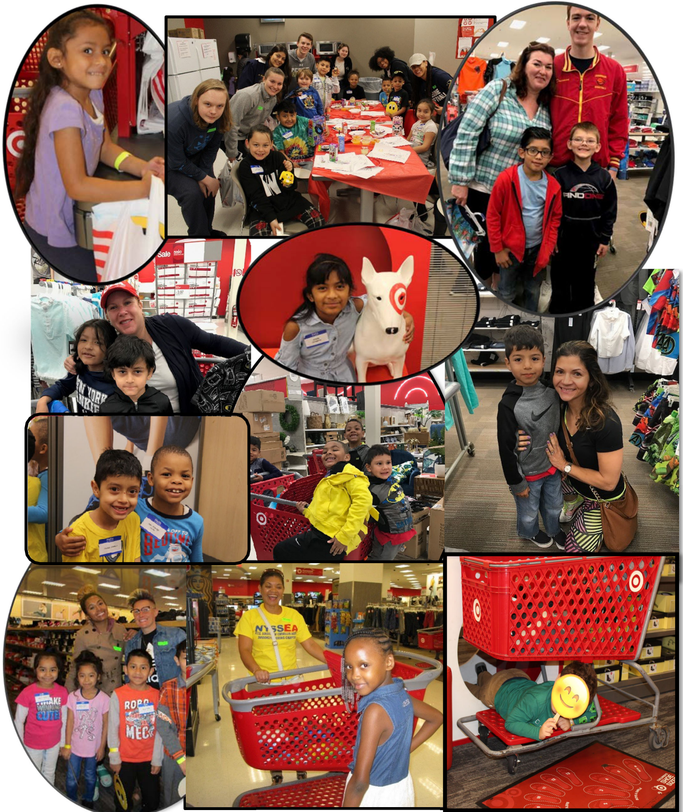
Making Smiles at Shopping Spree Clothing Events